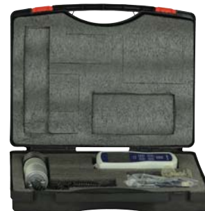
FG-7000T with Included Accessories and Carry Case