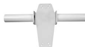
Optional MFP-Handle Ideal for Heavy Loads

*Note: Additional accessory adapters available. Please contact the factory.