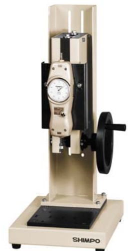
MF with FGS-100H Manually Operated Test Stand (sold separately)