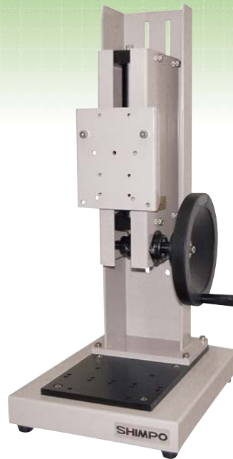
FGS-100H Hand Wheel Test Stand

Nearly all manufacturers' gauges are compatible with Shimpo's test stands for incredible versatility. These stands are designed for precision, balance, and durability. Therefore they are perfectly suited for measuring a limitless range of materials such as, wire, spring, plastic, paper cord, tubing, glass and composites.